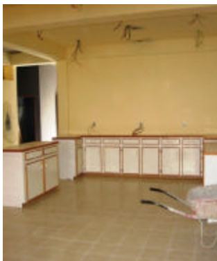
Abby's House, located in Eldridgeville Toledo District, while under construction

Weeks of rains caused massive flooding in the west and north of Belize in October 2008. The Rotary Club of Punta Gorda investigated the needs of the flood victims, and the Belize Red Cross asked for help with anti-fungal / anti-itch cream and cloth bandages. Plenty Belize was proud to assist by donating over $100 of medicine to our fellow Belizeans.