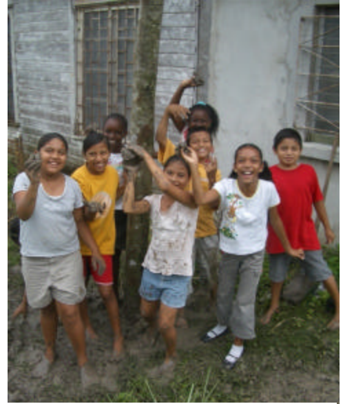
St. Peter Claver RC School Students constructing their garden fence