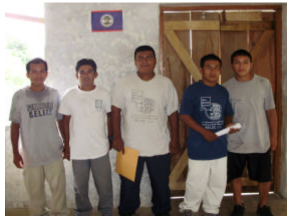
The San Pedro Columbia Pig Farmers Coop, recipients of a new business plan

ings on the line, endangering your family's stability and borrowing other people's money, it is your responsibility as a business owner to take calculated risks not unnecessary risks. The business planning process helps to manage and minimize those risks. It can be a long process to get it done properly, but the end result will be that you can understand your business as we Belizeans say "inside out".