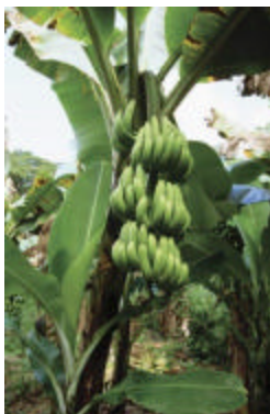
Banana and Plantains grow well here in Belize and are a really healthy snack

“Bananas are good sources of Vitamins A & C and Potassium. Plantains are good sources of Vitamin A and Potassium”