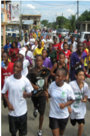
Participants in the 2007 Torch Run held in PG Town

“Bananas are good sources of Vitamins A & C and Potassium. Plantains are good sources of Vitamin A and Potassium”