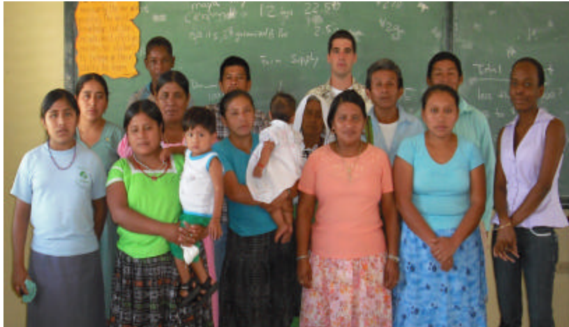
Participants and Facilitators in the 6th Micro-grant planning workshop