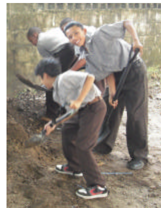
Students from Punta Gorda Methodist School working in the school garden

The WIN-Belize Torch Run is November 29th, come out and show your awareness of the issues that affect us all!