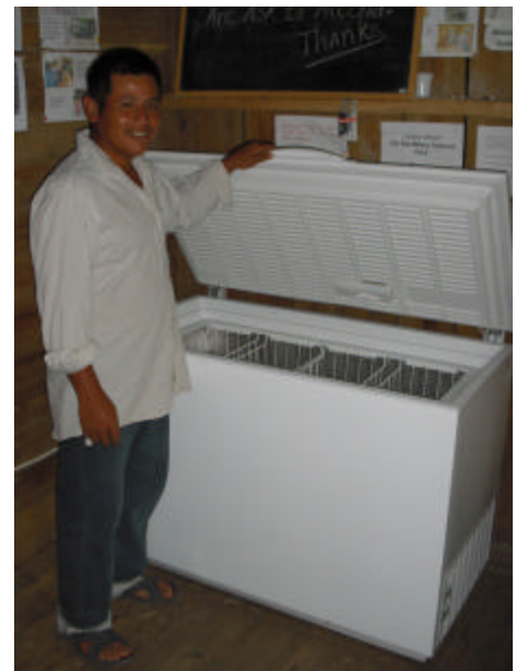
Member of Rio Blanco Mayan Association receiving a new DC refrigerator