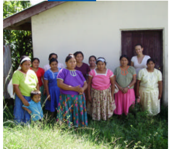
The Women of the Santa Teresa Rice Hullers Group