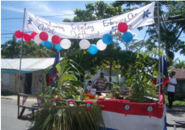
Plenty Belize's award winning float! Let's hope we do just as well in next year's contest!