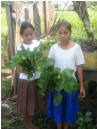
Growing organically is fun and so easy even children can do it!