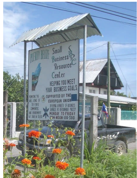
The new Plenty Belize and SBRC sign