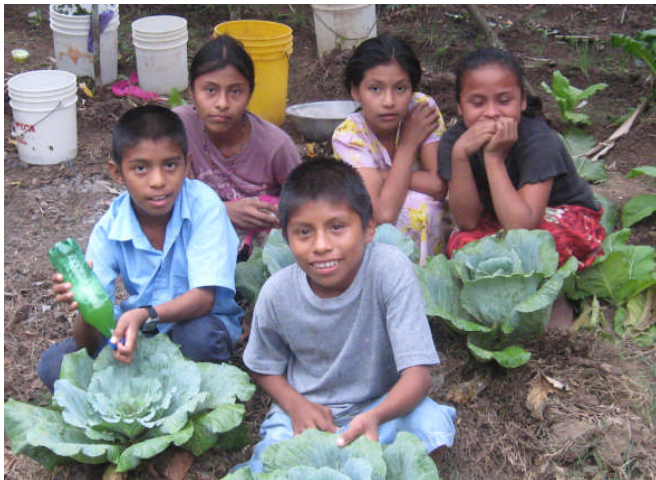
Aguacate Village Home Gardeners: