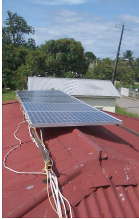
Plenty Belize's newly installed solar panels. Bringing sustainability to our office

“Whenever BEL power is off, our battery based system automatically provides AC power to our computers, fans, and lights”