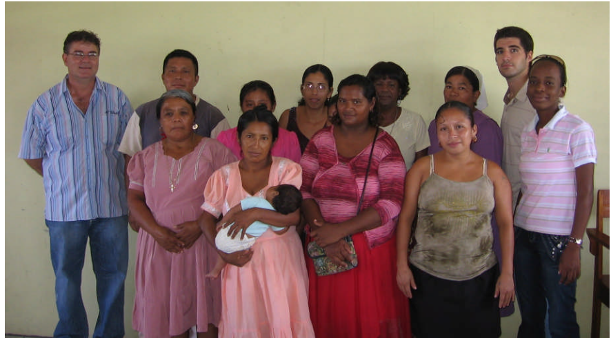
Participants of the fourth Planning your Micro-Enterprise class