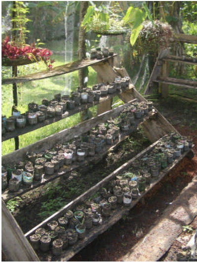
The Plenty Belize Shade Cloth Nursery, stop by and pick up some plants