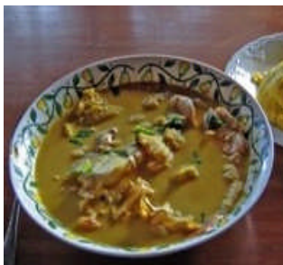
Delicious Fish Sere, healthy and easy to make!