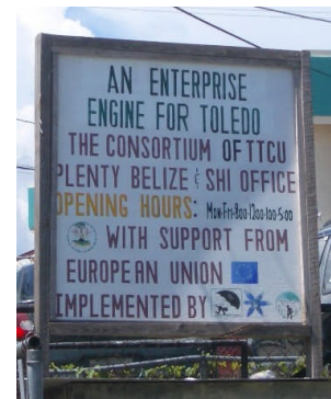
The Enterprise Engine for Toledo office is located on the corner of Queen St. and Front St.

Applications are still being accepting from interested groups. The second review of applications will take place in mid October. Interested groups are urged to visit the office for more guidance on how to apply for a grant.