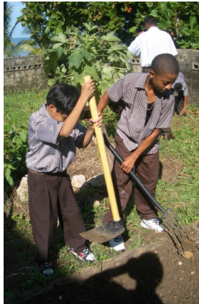
PG Methodist Students working hard in the school Garden